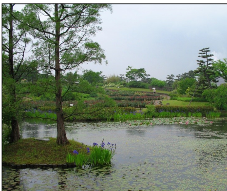
A lake filled with lily pads and irises with rose beds in the distance.

Today, Hamadera Park is still noted for its majestic pine trees where approximately 5,500 still are thriving after several centuries in the ground. Equally impressive is the Hamadera Park Rose Garden featuring 6,000 rose plants in approximately 400 varieties. Ground was broken for the start of development of the rose garden in July 1989 and it opened to the public in April 1991.