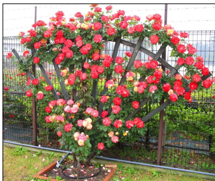
Climbing roses in the shape of a Japanese hand-fan.

The Hamadera Rose Garden features five distinct areas where one can see roses growing with views of waterways; lakes; mountains; seascapes; as well as a village setting. Each twist and turn in the garden brings new surprises and breathtaking views that come in to light as you meander through the lush landscape.