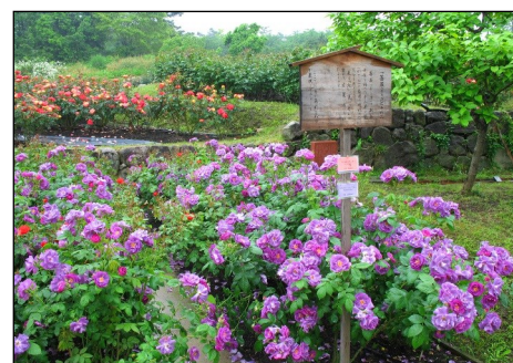
Rhapsody in Blue growing in a village setting.

This is definitely a rose garden to visit if you're in the area. The Hamadera Rose Garden is located at 〒 592-8346 Hamaderakoencho, Nishi-ku, Sakai-shi, Osaka. Open every day 10am-5pm except Tuesdays. Free Admission. Just a 3-minute walk from Hamaderakoen Station. While there, be sure to take notice of the numerous majestic pine trees that you probably won't be able to see anywhere else in the world.