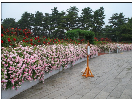
The entrance to the Hamadera Park Rose Garden.

The Rose Garden in Hamadera Park is located in Sakai City, Osaka. The park was one of the first public parks established in Japan and it is built on what was known as Takashi no Hama which translates to Takashi Beach . The area was noted for its beautiful white sand beach and numerous pine trees. Hamadera or “beach temple” was built near Takashi Beach and it is how the park got its name.