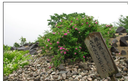
A shrub rose growing on a hilltop.

was soggy and wet, the Hamadera Rose Garden was one of the most enjoyable rose gardens that I have visited in Japan because it featured much more than just roses. I truly felt I was in Japan because of the varying Japanese backdrops that came into focus in every direction that I pointed my camera.