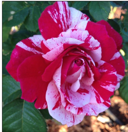
Scentimental —No two blooms are alike. Taken at the former UGC Rose Garden.

Scentimental is a vigorous medium, compact, rounded, bushy shrub growing to heights of 35 to 47 inches and widths of 31 to 43 inches. Its semi-glossy medium to dark green ruffled leathery foliage serves as a perfect backdrop to highlight the dazzling red and white blossoms. It flourishes best in full sunlight, although it is known to tolerate some partial shade. It has good disease resistance, but it can be susceptible to blackspot.