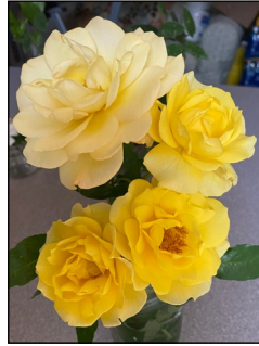
Rose photos by Teri Deptula

As they mature, their color gracefully fades from a rich yellow to a light yellow, creating a stunning display across the bush. Known for its good disease resistance and heat tolerance, Morning Has Broken blooms in flushes throughout the season. It grows in a rounded form up to 4 feet in height and over 4-1/2 feet wide at maturity.