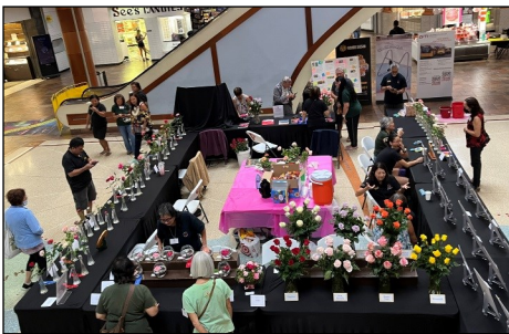
View of the Rose Show from the Second-Floor of Pearlridge Mall.

The Honolulu Rose Society (HRS) was delighted to be warmly welcomed back to Pearlridge Center for our Fall Rose Show and Competition on Saturday, October 26, 2024, after holding it at Kahala Mall for many years.