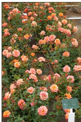
Easy Does It

The MARC Rose Garden previously served as an All-America Rose Selection (AARS) rose trials test rose garden until 2015 with the demise of the AARS. Today, the garden serves as an American Garden Rose Selection (AGRS) trial garden. The AGRS is the rose testing system that took over where the AARS left off. In this evaluation system, roses are evaluated three times per growing season for two years and the best are given the designation of AGRS winning rose variety.