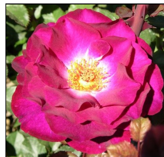
Wild Blue Yonder

The HRS Rose Petals newsletter is published on a monthly basis. If you would like to submit an article and/or photos, please email to: